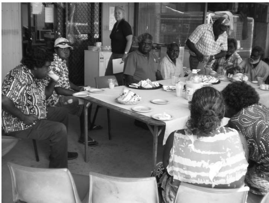
Lahynapuy Homelands Association