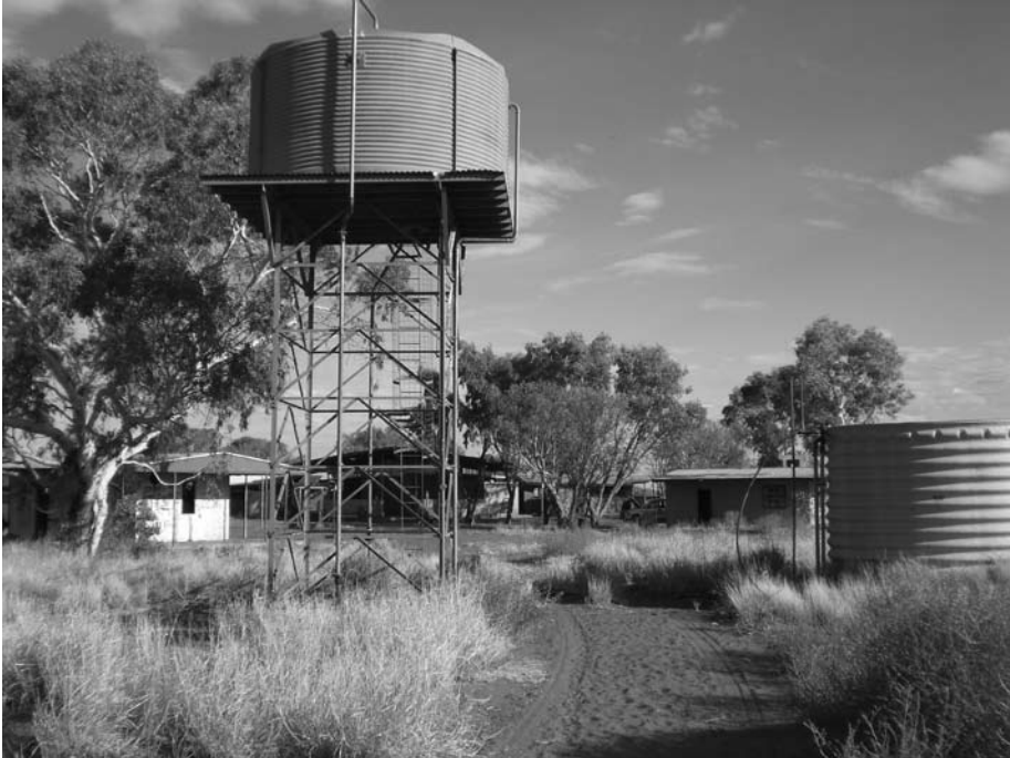
..... Mt Theo Outstation

The following case study of the Mt Theo Outstation shows how one community used its traditional country to run a social well-being program for young Aboriginal people engaging in risky behaviours.