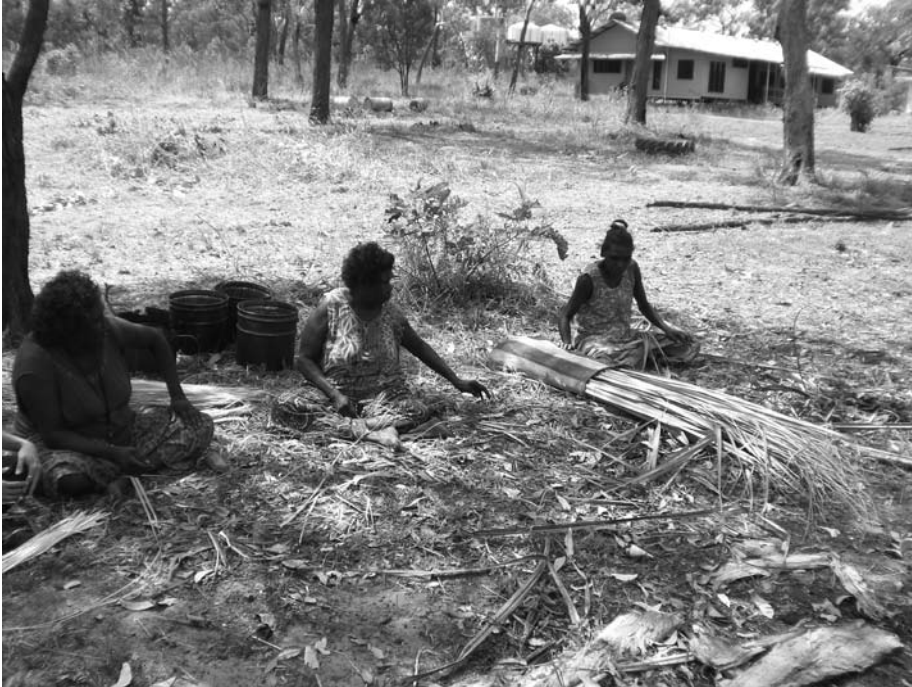
Roslyn Malngumba, Linda Marathuwarr, and Caroline Gulumindiwuy at Mapuru

Homeland communities such as Mapuru have followed another path for economic development. They have been building cultural tourism projects. Such projects would not be possible if the community was residing in a centralised community.