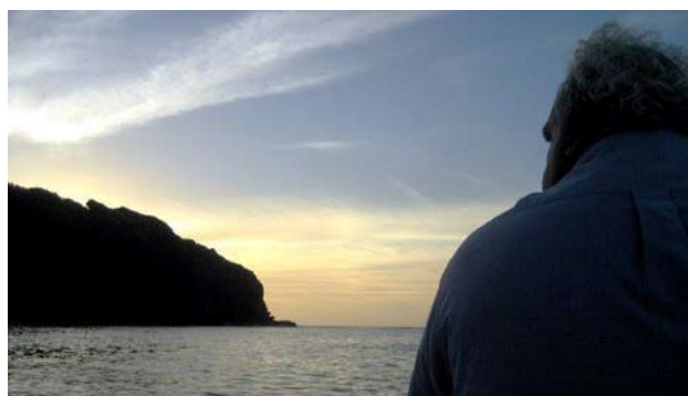
Aboriginal and Torres Strait Islander Social Justice Commissioner Tom Calma visiting Mer Island to discuss the Islanders' views on maintaining and protecting their native title rights and interests. Photo: Cecelia Burgman (2009).