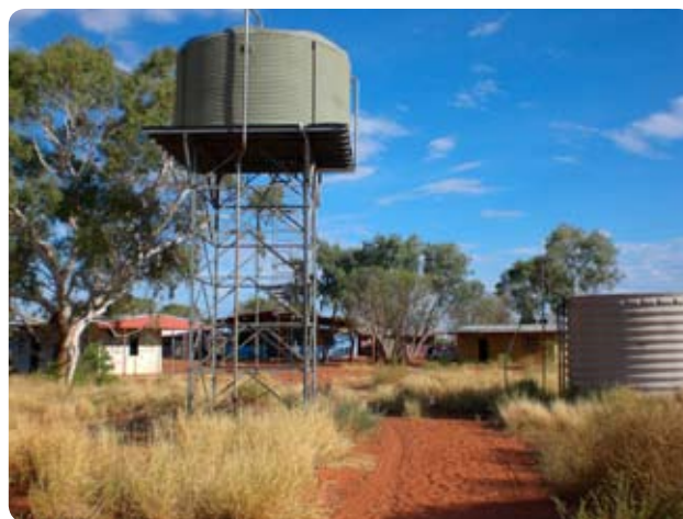
Mt Theo Outstation. Photo: Fabienne Balsamo (2009).