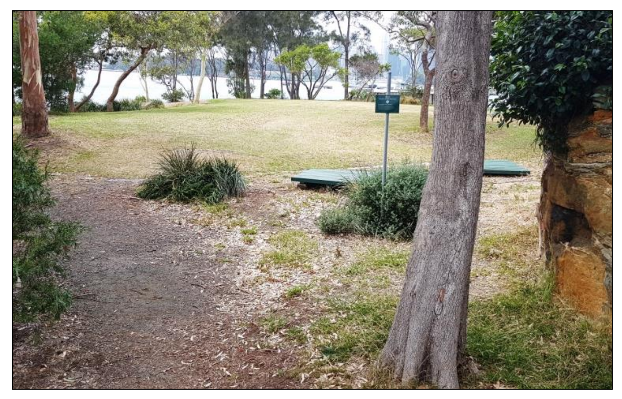
Image 4: Yurulbin Park entrance from road level – Yurulbin Park is listed on the council heritage register.