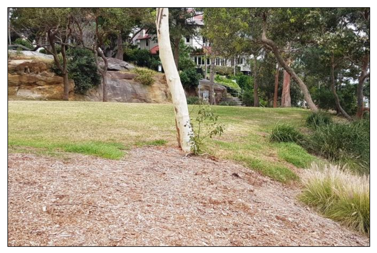
Image 5: Yurulbin Park highlighting the gradient change required from road level to water level – Yurulbin Park is listed on the council heritage register.

Image 4: Yurulbin Park entrance from road level – Yurulbin Park is listed on the council heritage register.