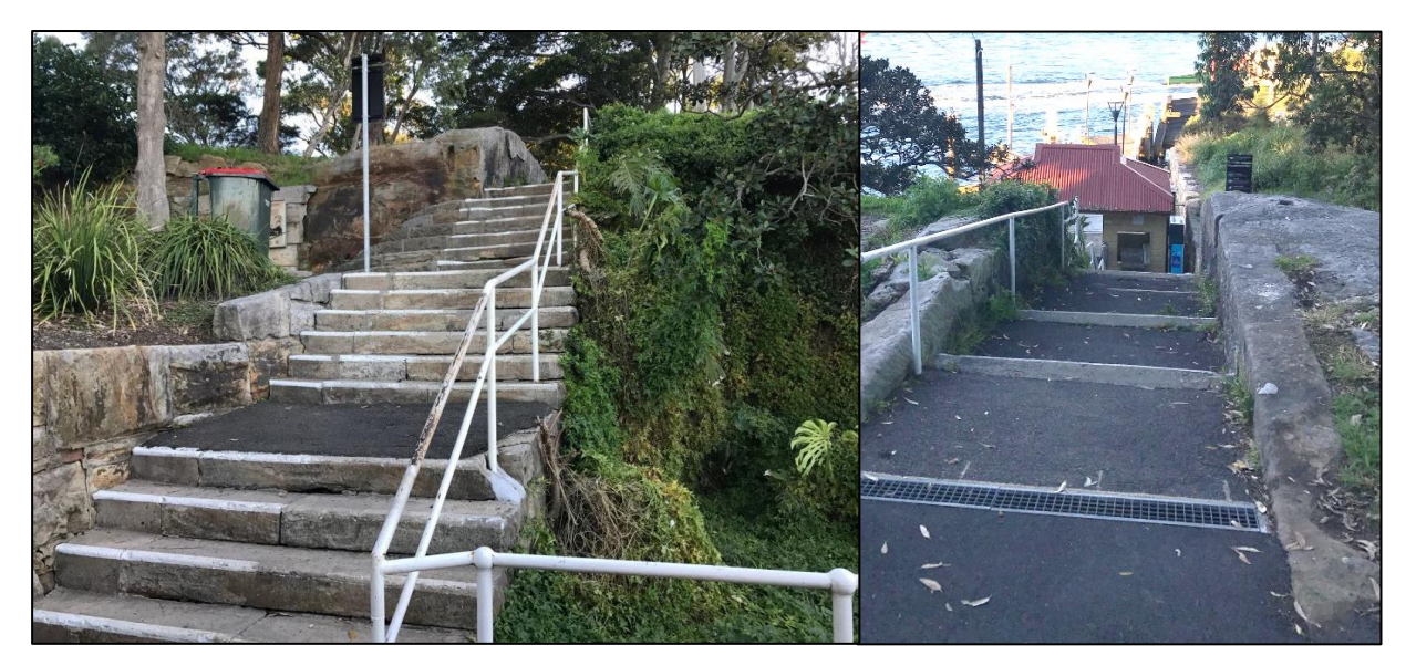
Image 2: Current stair access from Louisa Road to Birchgrove Wharf highlighting the steep gradient change required from road level to water level.

Image 1: Land ownership extract for Birchgrove Wharf. The blue line indicates the separation between the landside components and the wharf.