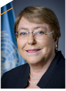
Dr Michelle Bachelet UN High Commissioner for Human Rights