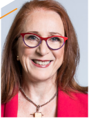
Emeritus Professor Rosalind Croucher AM , President, Australian Human Rights Commission