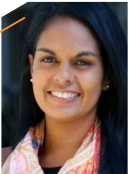
Teela Reid Lawyer, human rights advocate and activist