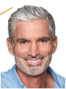
Craig Foster Former Socceroo, Broadcaster, Sport and Human Rights Advocate