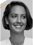
Brooke Boney Reporter, TODAY Show