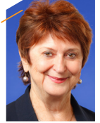
Susan Ryan AO Former Age Discrimination and Disability Commissioner at the Australian Human Rights Commission and freelance advocate for the rights of older people