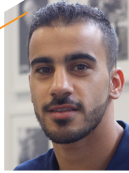
Hakeem al-Araibi Community and Human Rights Advocate, Football Victoria