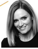
Dr Julia Baird Journalist, broadcaster, columnist and political commentator