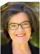
Cathy McGowan AO Former Independent MP, women's rights advocate and community worker