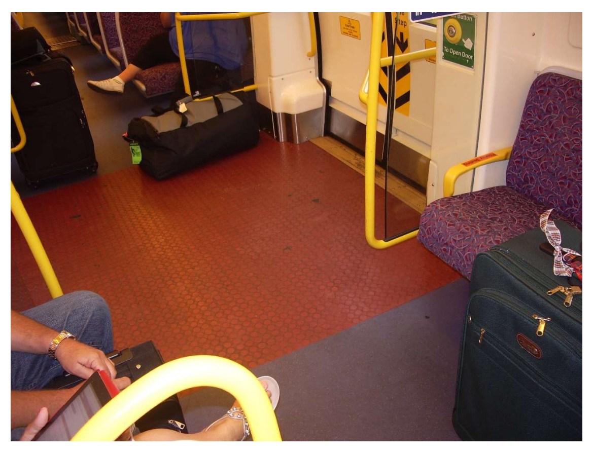
Photo above shows fixed seating and vertical handrails blocking flexible use at the vestibule with inevitable luggage creating a barrier to other passengers as well as delays during loading and unloading at stations.

The following photos relate to the "Airport train" and/or retrofits to earlier trains.