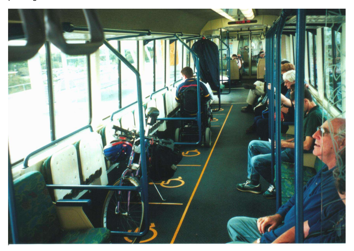
Interior of "Airport train" illustrating multi-use space flexibility.

There is space for a number of bikes and/or access vehicles/devices. Large suitcases, surfboards, etc can also be accommodated in this type of space which also provides encouragement for passengers to move into the body of the carriage rather than block the vestibule. Very large numbers of passengers can also be carried as standees.